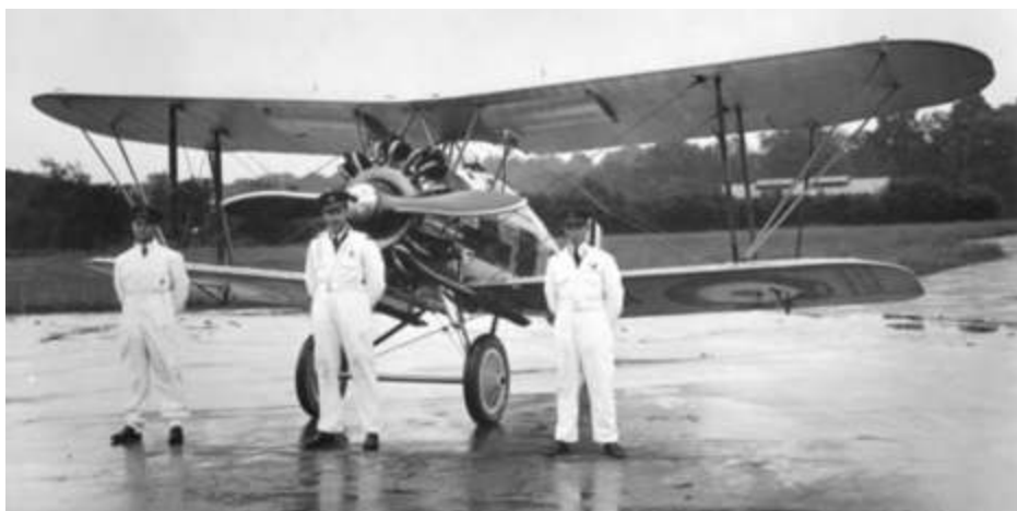
Image below showing training for the 1932 Hendon airshow with a Gloster Gamecock is from The Genealogist.

If you are organised you can take up their two week free trial offer but be careful to either cancel it then or allow them to sign you up to full membership.